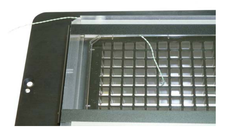
Figure 3: Sensor Placement for Temperature Calibration

It is recommended to perform this routine when a change of temperature conditions has occurred.