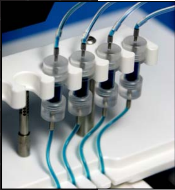
Perifusion Chamber setup