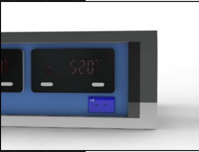
Large LCD Display